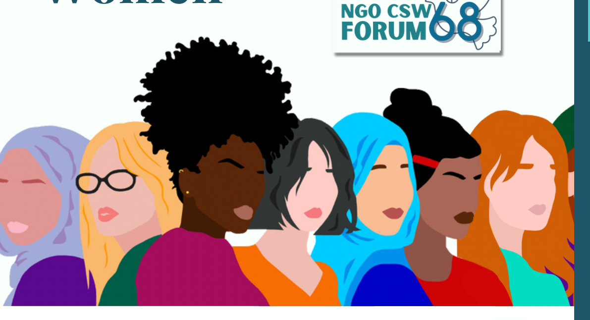
A UN CSW 68 parallel event to take stock of States' and UN agencies' progress in ensuring that women and girls belonging to minority groups have equal access to social protection systems, public services, and sustainable infrastructure